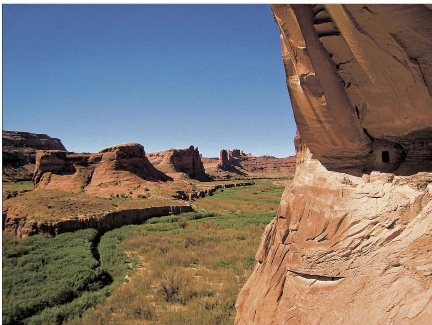
A lonely granery amidst the greenery of San Juan County. Enter your photos in our Photo of the Week contest. We will pay $10 for each photo that runs in the San Juan Record. You can email your entries to sjnews@frontiernet.net.

HOMETOWN NEWSPAPER FOR SAN JUAN COUNTY, UTAH SINCE 1915 Volume 95 Number 52 50 cents September 29, 2010