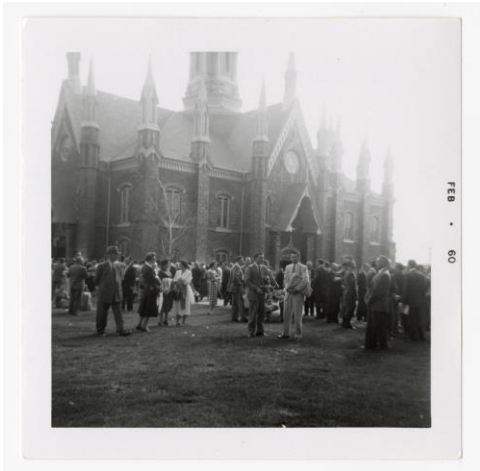
Assembly Hall at Temple Square, Salt Lake City, Utah, 1960.

SAMPLING of the type of every-day items collected at SCAN & SHARE EVENTS elsewhere in Utah.